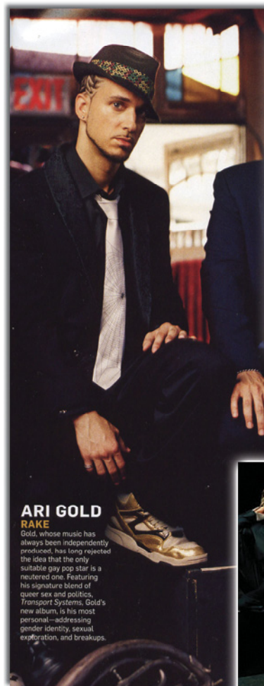
ARI GOLD RAKE Gold, whose music has always been independently produced, has long rejected the idea that the only suitable gay pop star is a neutered one. Featuring his signature blend of queer sex and politics, Transport Systems , Gold's new album, is his most personal—addressing gender identity, sexual exploration, and breakups.